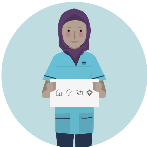
Speech and language therapist